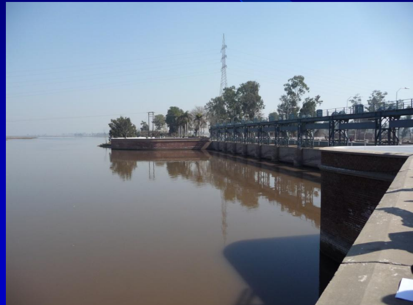
Balloki Barrage, Ravi River, Pakistan