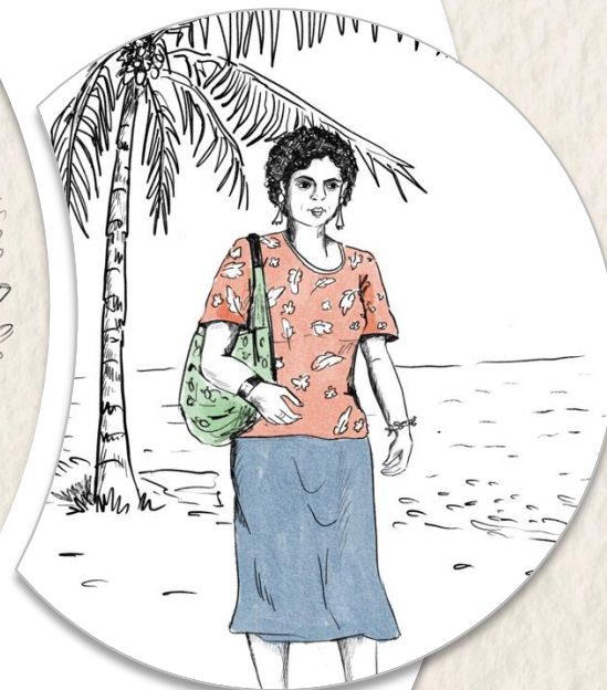
Repeka Suva, Fiji