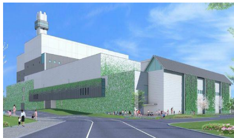
Kyoto City South Clean Center