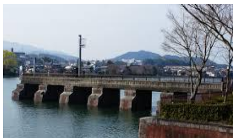
Lake Biwa Arai Weir & Aqua Biwa Museum