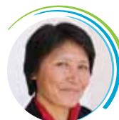
DORJI CHODEN Minister Ministry of Works and Human Settlement Bhutan