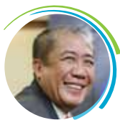
ARTHUR TUGADE Secretary Department of Transportation Philippines