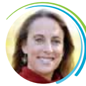
STEPHANIE RAMBLER Sustainable Development Officer United Nations Department of Economic and Social Affairs