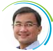
ROBERT C. EUSEBIO Mayor City of Pasig Philippines