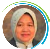
TRI RISMAHARINI Mayor City of Surabaya Indonesia