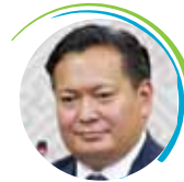
PURVEE BAYARKHUU Deputy Mayor Municipal Government of Ulaanbaatar Mongolia