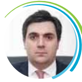
ILIA DARCHIASHVILI First Deputy Minister Ministry of Regional Development and Infrastructure Georgia