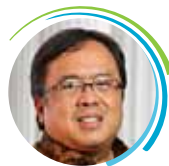
BAMBANG BRODJONEGORO Minister Ministry of National Development and Planning (BAPPENAS) Indonesia