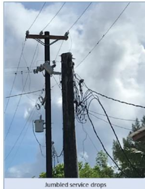
Jumbled service drops