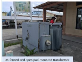
Un-fenced and open pad-mounted transformer