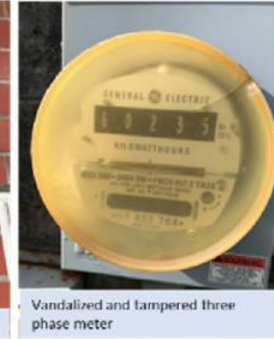
Vandalized and tampered three phase meter