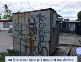
Un-fenced and open pad-mounted transformer