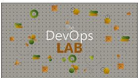
The DevOps Lab