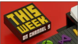
This Week On Channel 9