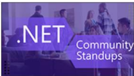
.NET Community Standups