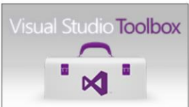
Visual Studio Toolbox