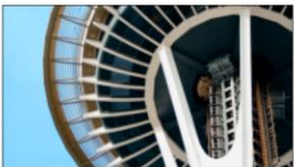
The Countdown to Microsoft Build 2019