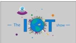
Internet of Things Show