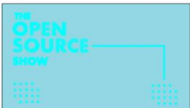
The Open Source Show