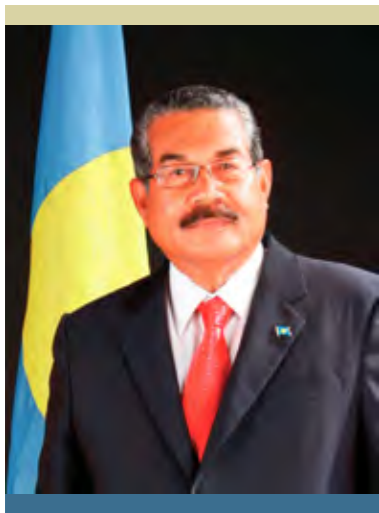
H.E. Johnson Toribiong President of the Republic of Palau

Palau, like the rest of the world, faces two major energy challenges. The first is to deliver clean, secure, affordable energy for all citizens of Palau while treating the environment responsibly. The second is to respond to the risks of climate change by adaptation to changes and by mitigation through reducing the greenhouse gases caused by the production and use of energy. In addition Palau faces a challenge that it shares with other small island countries, namely it's extremely high dependence from imported fuels.