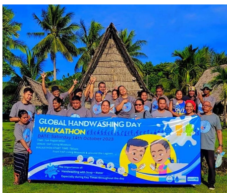
Image 1: Global Handwashing Day Celebrations in Yap, Federated States of Micronesia

In an interactive poll during the webinar, participants unanimously agreed that everyone has a role to play to support handwashing with soap. Kencho Namgyal, UNICEF Chief of WASH in the Pacific, presented an overview of handwashing in the Pacific using the 2022 WHO/UNICEF Joint Monitoring Programme for WASH (JMP) data. There are three key elements needed for people to be able to wash their hands effectively: access to handwashing facilities with water, access to soap, and practicing correct handwashing behaviors. In over 18 Pacific Island Countries (PICs), more than 1 in 3 households are served by utilities, representing approximately 54% of the Pacific population (excluding PNG) (WHO/UNICEF, 2022; PWWA Benchmarking Report, 2021). Water utilities play a central role in hand hygiene through the delivery of water.